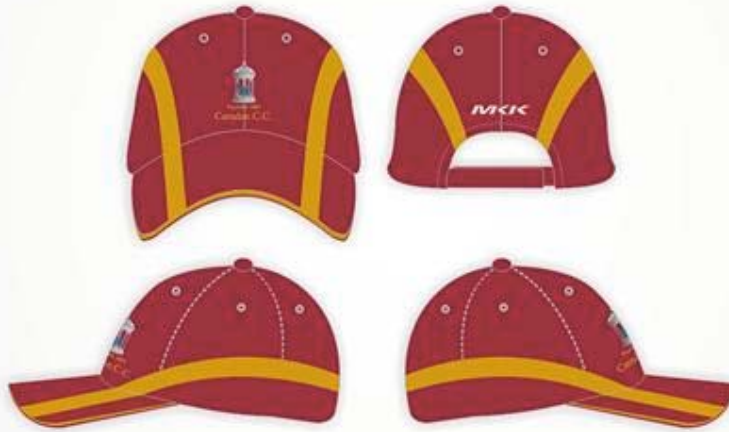
SANDWICH PEAK CAP MAROON COTTON TWILL WITH VELCRO FASTENER