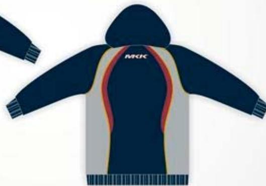
HOODY 300g COTTON FLEECE WITH CONTRAST HOOD LINING DETAIL & EMBROIDERED OR SCREEN PRINTED CENTRE CHEST LOGO

TEAMID PLUM 80118 NAVY 80122 PLUM 80118 GREY 80118