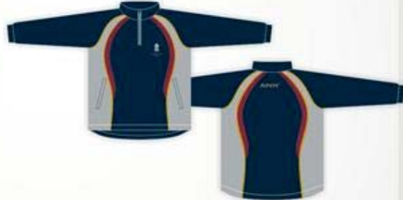
TRACKSUIT JACKET MICROFIBRE WITH MESH LINING QUARTER ZIP & 2X ZIP POCKETS

TEAMID GREY 80118 PLUM 80118 NAVY 80122 NAVY 80122