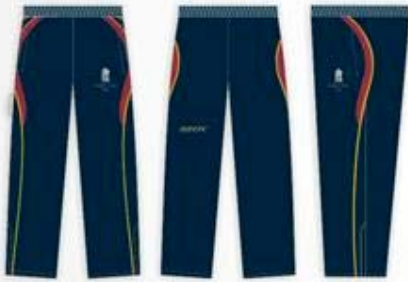
TRACKSUIT TROUSERS MICROFIBRE WITH MESH/NYLON, SHIN OR KNEE ZIPS & 2X ZIP POCKETS