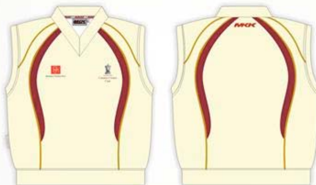
STYLE: WAVE SLIPOVER: ISOPRO TRICOT, POLY MESH PANELS, QUILTED LINING & ROUND PIPING